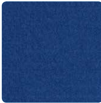
2402 JELLO BLUE