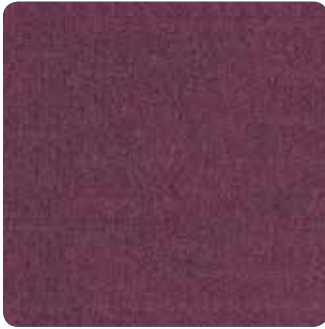
2404 PURPLE FUZZ