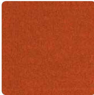
2409 ORANGE SUN