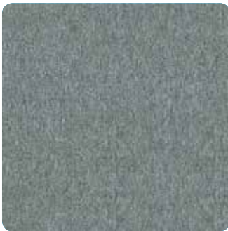
2507 GREY MINE