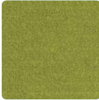
2405 APPLE GREEN