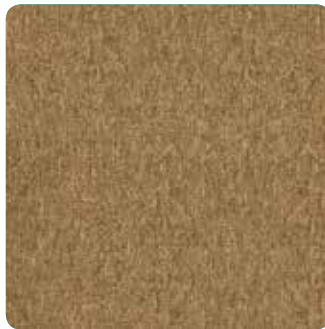
2508 COFFEE CLUB