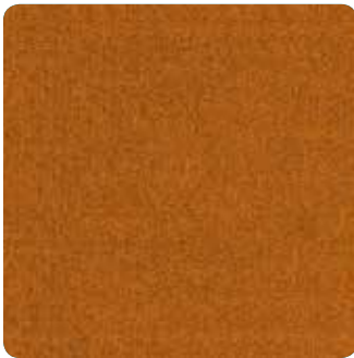
2406 ROYAL GOLD