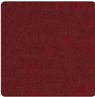
2401 FREEZER RED