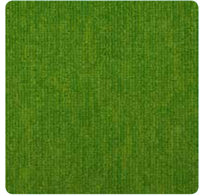
4152 MERRY GREEN