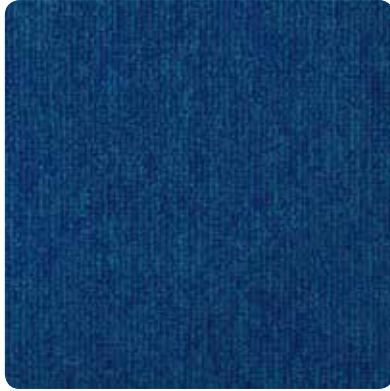
4151 BOBBY BLUE