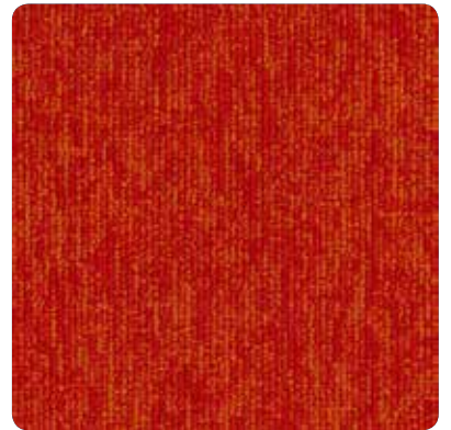
4154 DEEP ORANGE