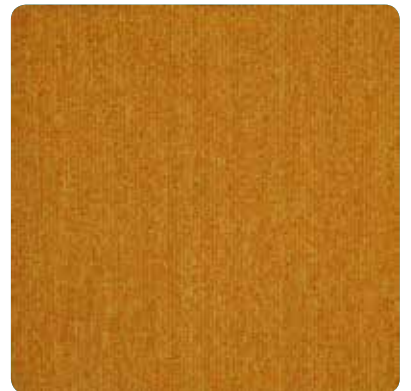
4156 CHROME YELLOW