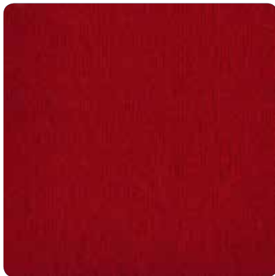
4155 VELVET RED