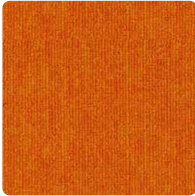
4153 LIGHT PEACH