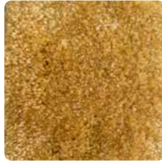
354 GOLD LEAF