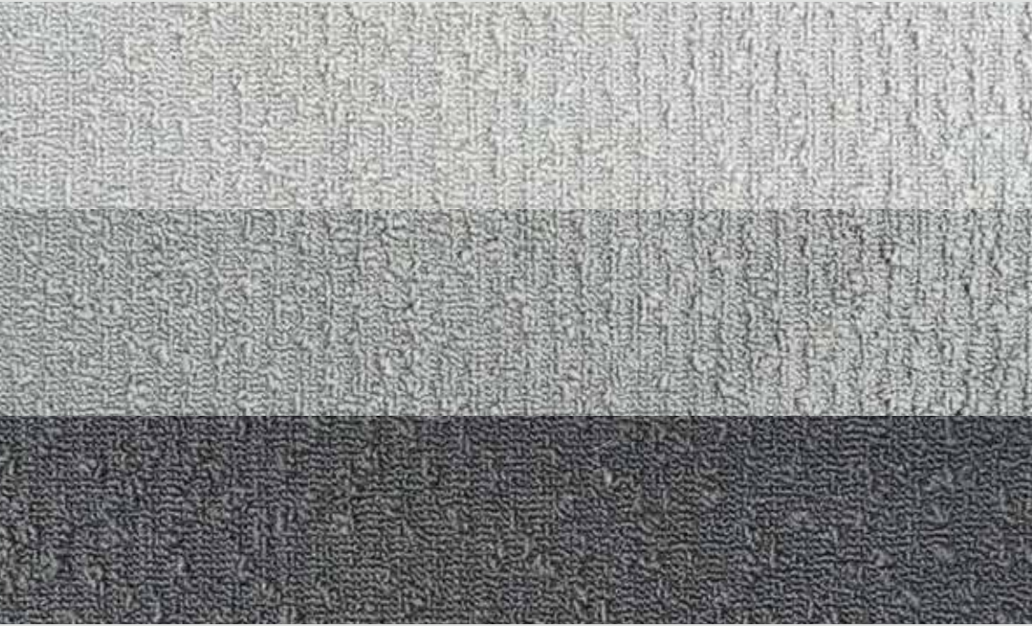
101 Light Grey