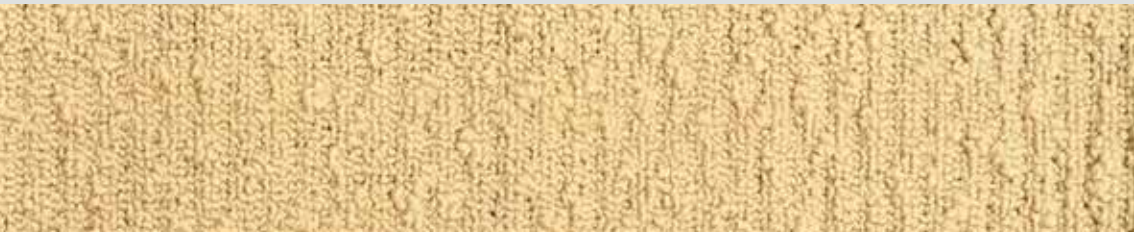
112 Yellow Mustard