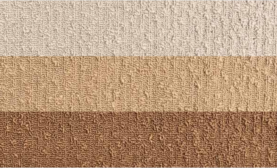
109 Light Beige

Solution Dyed • ECO BACK - “PVC Free” • Anti-Static • Flame-Retardant