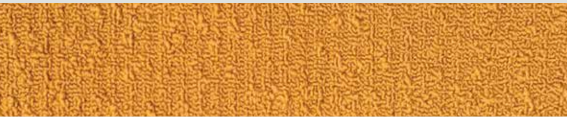
113 Pumpkin Orange