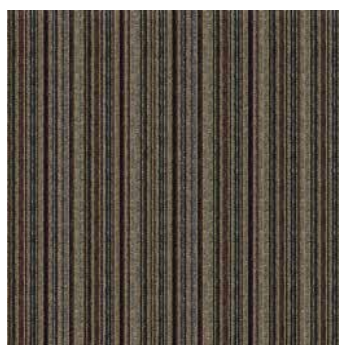
1364 RICH EARTH