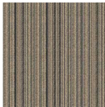
1361 MALIBU SAND