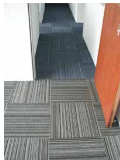
MELODY 1 - 1366 NOVEMBER SKY AND 1365 CONTINENTAL BLUE (Office at the Central Singapore)