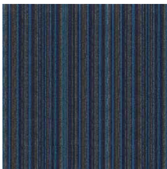
1365 CONTINENTAL BLUE