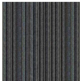
1366 NOVEMBER SKY