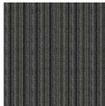
1362 GLACIER GREY