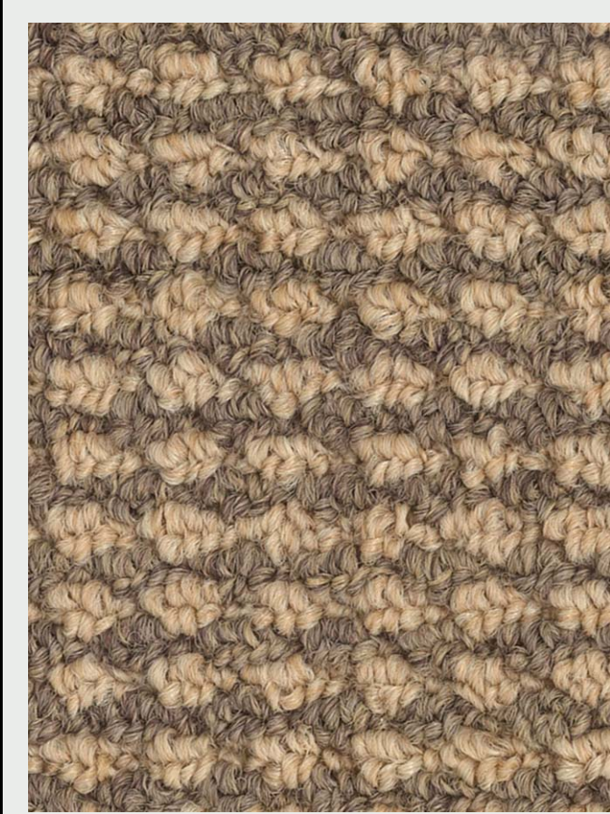
502 Tidal Gray