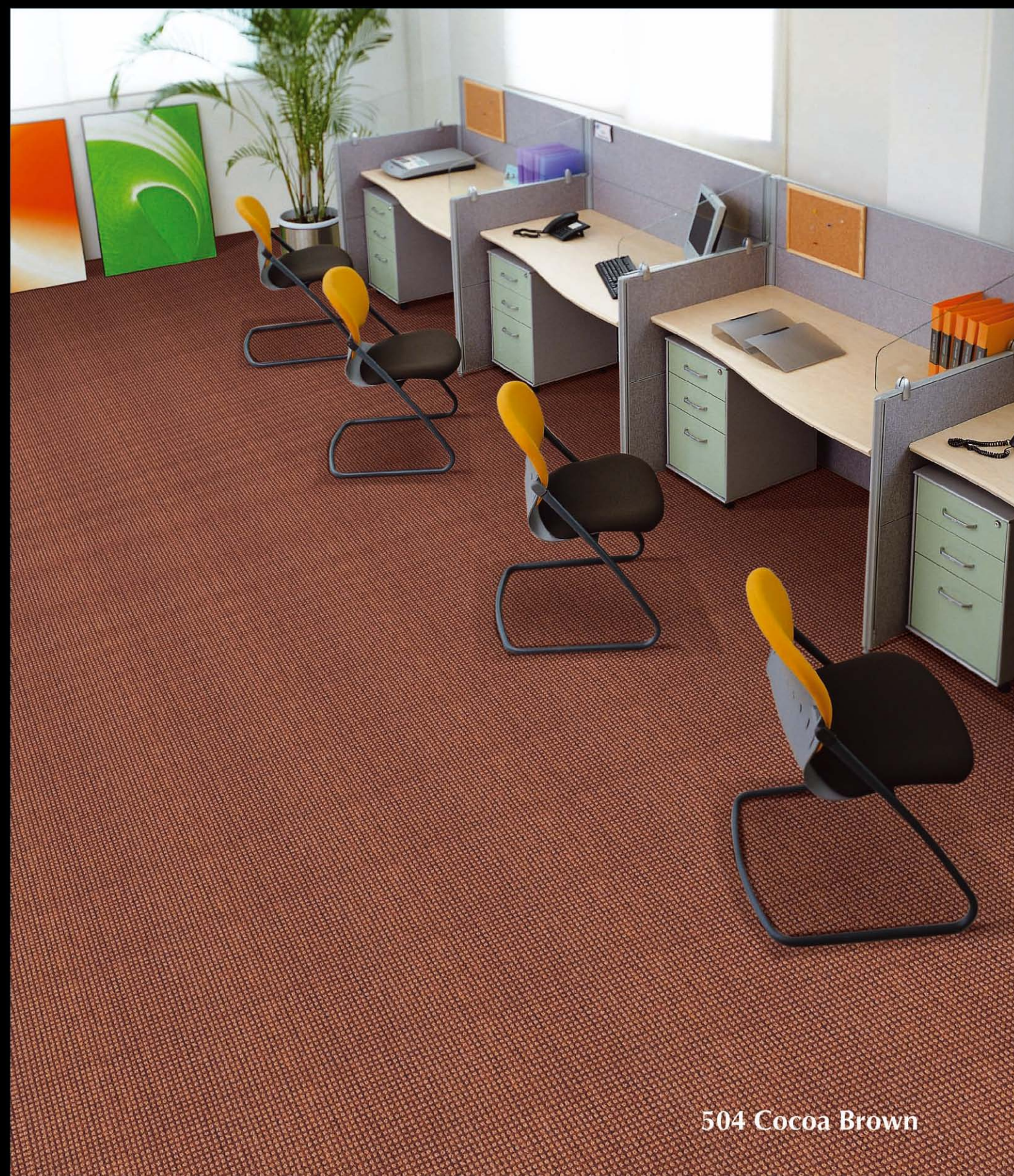
504 Cocoa Brown