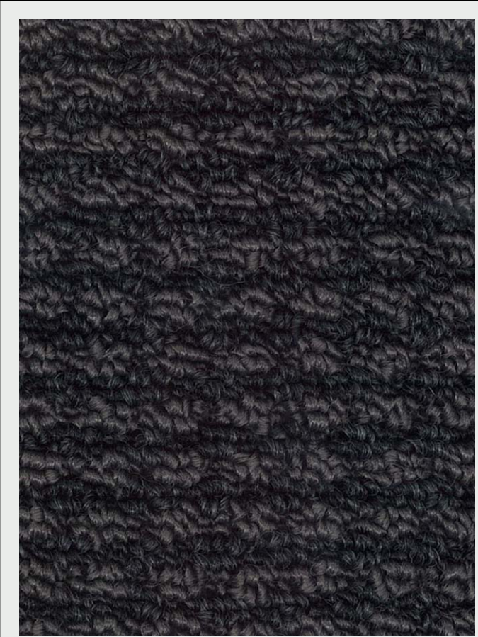
511 Dawn Grey